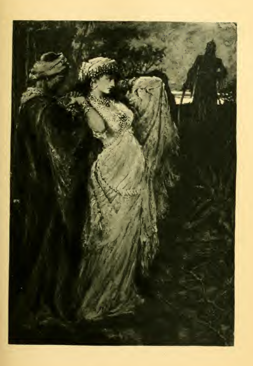
My it is a sinord